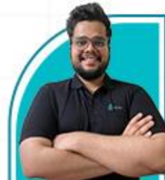
Kinshuk Sir ABM Expert