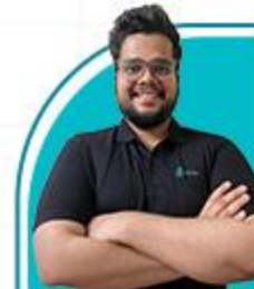
Kinshuk Sir ABM Expert