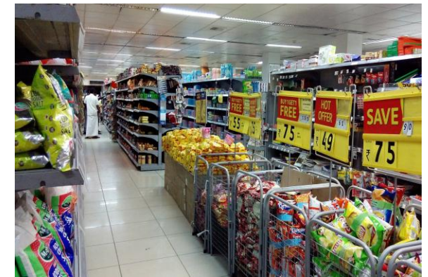
WHOLESALE PRICE INDEX (WPI)